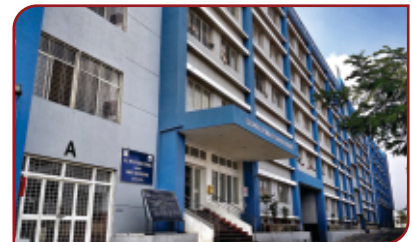
S. B. Patil Public School (www.SBPATILSCHOOL.com)

CBSE Curriculum KG To XII Contacts: 7030183183 / 8087211888