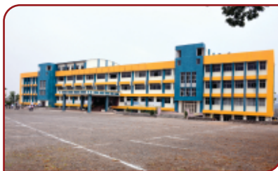
Nutan Maharashtra Institute of Engineering & Technology (www.NMIET.edu.in)

DTE Code - 6310 BE (Mech/EnTc/ Comp/ IT) & B. VOC Courses Contacts: 02114-231666 7423080910 / 7424080910