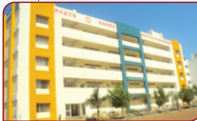
S. B. Patil Institute of Management (www.SBPATILMBA.com)

DTE Code - 6192 MBA (MKT / Finance / HRM / OSPM / BA & Minor Specialization) Contacts: 020-2765 6900