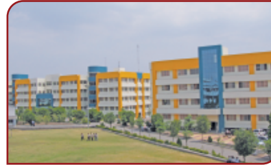
Pimpri Chinchwad College of Engineering (www.PCCOEPUENE.com)