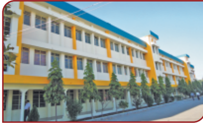
Pimpri Chinchwad Polytechnic (www.PCPOLYTECHNIC.com)

DTE Code - 6413 Diploma (Mech / EnTc/ Comp /IT/ Civil) Contacts: 020-2765 8797