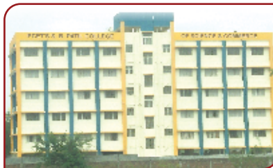
S. B. Patil College of Science & Commerce (www.SBPATILCOLLEGE.com)

11 th Science & Commerce Contacts: 9665333344 / 9767199039