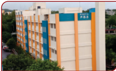
Pune Business School (www.PUNEBUSINESSSCHOOL.com)