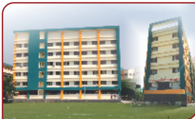
S.B. Patil College of Architecture & Design (www.SBPATILARCHITECTURE.com)

DTE Code - 6840 B.Arch Contacts: 020-27659199