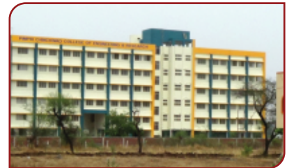
Pimpri Chinchwad College of Engineering & Research (www.PCCOER.com)

DTE Code - 6822 BE (Mech/E&TC/Comp/Civil/IT) Contacts: 8237238080